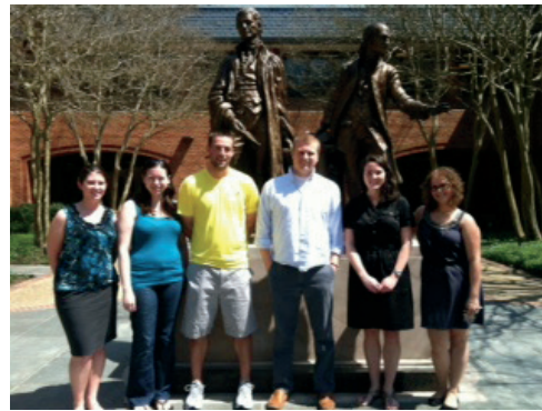
Volume 55 Notes Selection Committee