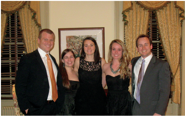
Members of the Volume 54 Executive Board